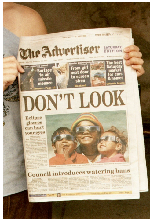
A newspaper headline in Australia just before last December's eclipse

'The Advertiser' – SA's only major daily newspaper – has been printing a monthly astronomy article (written by an ASSA member) for many years. This article had already discussed eclipse viewing many times, including the use of eclipse shades. But on Saturday 30 November The Advertiser finally published their first major story on the eclipse. They had just learned of the WA ban, so the front page headline screamed 'DON'T LOOK' in 10 cm high type, and stated that eclipse shades were unsafe to use.