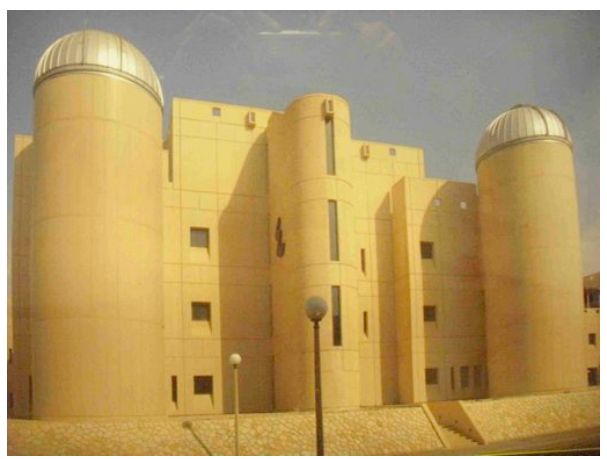
Figure 1 The telescope domes' location at KSU

The Astronomical Observatory at King Saud University (KSU), originally established and inaugurated at Al Malaz in 1976 by prince Salman bin Abd Alaziz, is considered one of the earliest modern observatories in the Arabian Golf. Since its move to Al Dareyah KSU main campus, the telescopes (domes) have been installed on the roof of the College of Science (Figure 1).