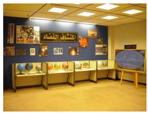
Figure 5 One side of the astronomical museum room