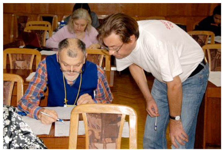
Figure 4 Jury work

As is usual at these meetings, the jury board decided to establish the levels for the 1<sup>st</sup> Diploma, 2<sup>nd</sup> Diploma, 3<sup>rd</sup> Diploma (corresponding to the Gold, Silver and Bronze Medals), as well as the Diploma of Participation.