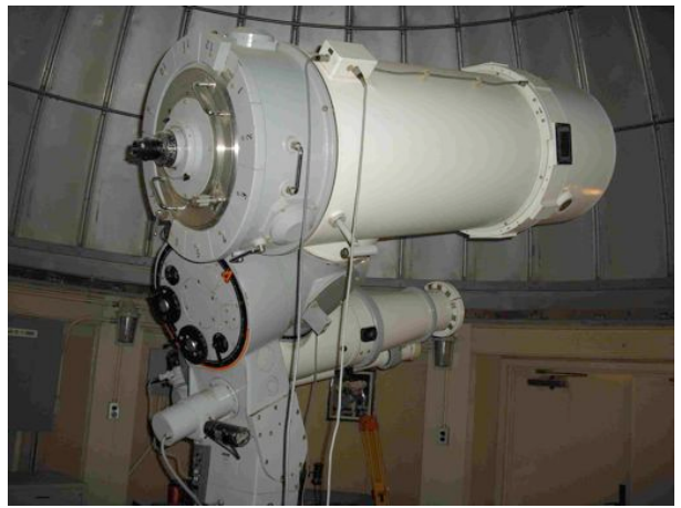
Figure 3 The 45 cm double telescope (non-operational)