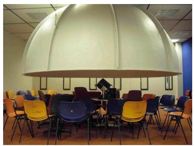
Figure 4 The mini sky-show planetarium

Planetarium: The mini sky-show planetarium at the Astronomy Unit (Figure 4) offers an enjoyable sky illustration for celestial navigation. The planetarium has the form of a hemisphere and can accommodate about 20-25 visitors at time. Amateur astronomers, school students and the general public can follow an exciting and funny 20 minutes exhibition about the secrets of space, identifying the movement of most popular stars and constellations.