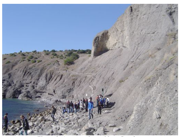
Figure 3 An excursion to Novy Svet bay

Just before the final day of the Olympiad, participants visited a beautiful reserved place in Crimea – Novy Svet (Figure 3). In this place the famous Crimean champagne is produced.