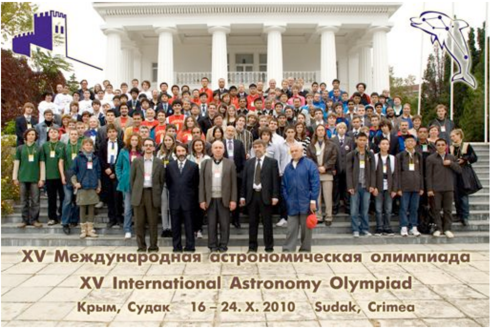
Figure 1 The opening ceremony

On 17 October the opening ceremony of the Olympiad took place (Figure 1).