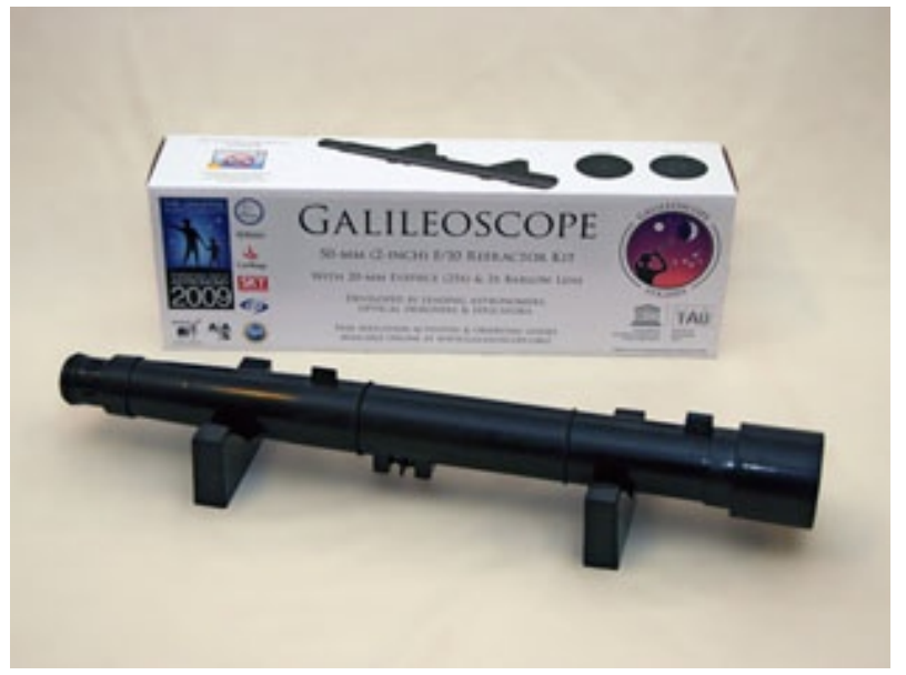
The Galileoscope with its box

As a cornerstone project of the 2009 International Year of Astronomy, Galileoscope was initiated to develop, produce, and distribute telescopes of a suitable size and type and at a low-enough price to bring hands-on astronomy to the masses, especially those unable to afford a telescope. It is hard to deny that this project succeeded, with nearly 200 000 telescopes distributed to over 100 countries, and over 7000 distributed in a donation program to those who could not otherwise purchase a telescope.