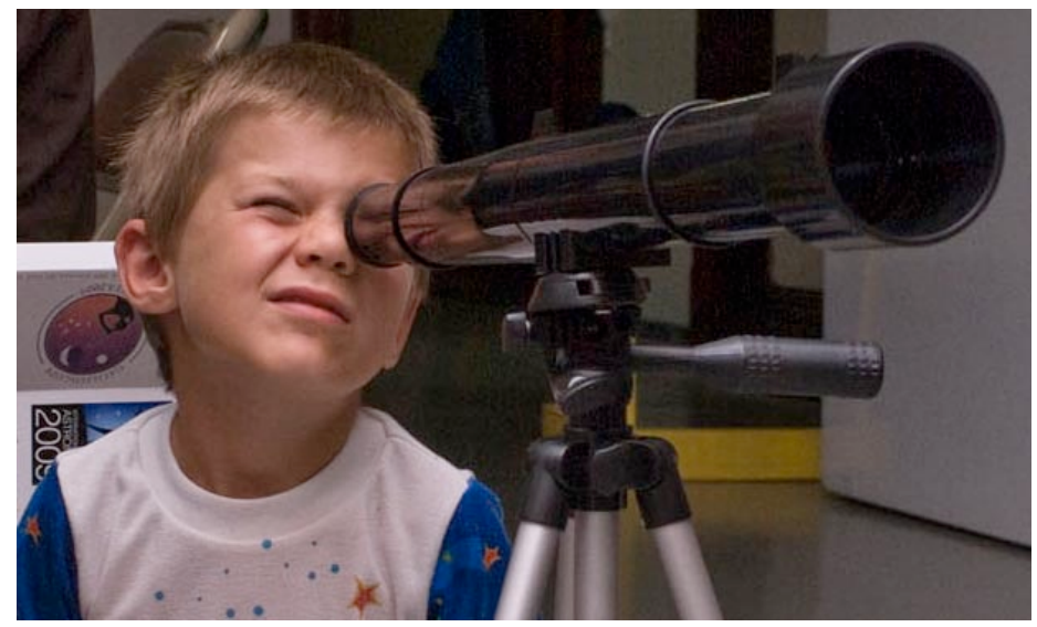
The Galileoscope in use

As a volunteer effort, Galileoscopes are supplied at the lowest possible cost. They are available in individual units from several retailers, and in bulk (case) quantities directly from Galileoscope (www.galileoscope.org), and are a perfect complement to outreach and teaching activities. We hope the community will continue to acquire Galileoscopes and utilize them in their programs, get them into the hands of children and adults everywhere, and sustain the efforts begun during the International Year of Astronomy.