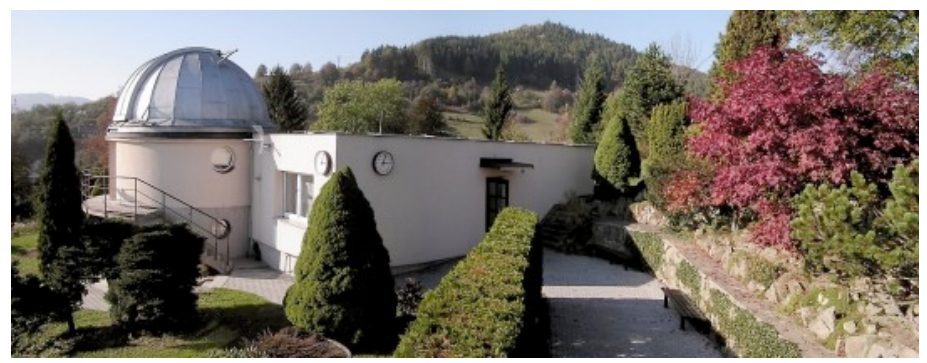
The public observatory in Vsetin (population about 29 000)

Public access to telescope viewing in the US and Canada is mainly through amateur groups and college observatories. But locating such venues and coordinating with their schedules can be hard when a family wants to view the Moon or brilliant Jupiter at short notice. A recent trip to the Czech Republic showed me another pathway to the stars that might teach us some interesting lessons about the popularization of astronomy.