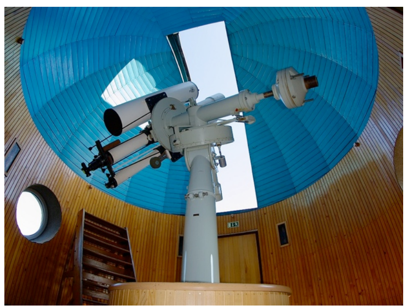
Zeiss 200 mm and 150 mm refractors at Vsetin Observatory

The Petrin Observatory was followed in 1937 by another in Ceske Budejovice (once known as Budweis, where Budweiser beer originated), and in 1938 in the smaller town Tabor south of Prague. The aim of these early installations was to provide easy access to the wonders of the night sky for everyone and they also served as a nucleus for amateur clubs. In the period between the two World Wars, Czechoslovakia was a highly industrialized, democratic nation and astronomy was recognized as an important element in the education of its citizens. We would do well to remind ourselves of this in the USA today.