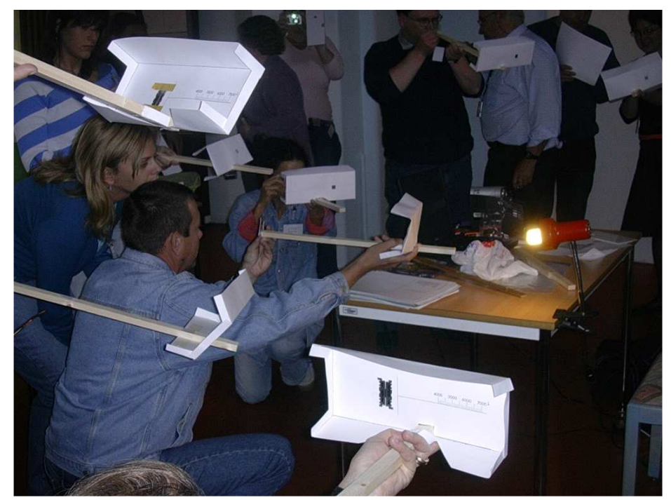
Workshop in the EAAE Summer School

The objective of the observation sessions is to introduce the participants to the use of small telescopes and binoculars, as well as to observations made with the naked eye. Photographs are also taken. The main objects observed are: constellations, planets, galaxies, etc. which are visible.