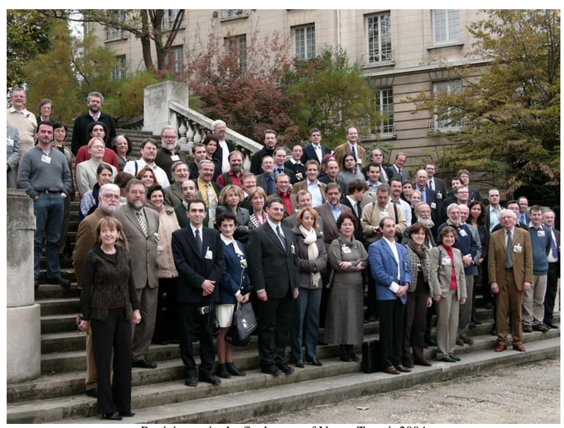
Participants in the final event of Venus Transit 2004

ESO and the EAAE have set up, together with the Institut de Mécanique Céleste et de Calcul ds Ephémérides, theObservatoire de Paris, and the Astronomical Institute of the Academy of Sciences of the Czech Republic, a European project based on the unique event of the Venus transit of 8 June 2004. This project offered the possibility to students to contribute, by rather simple observations, to the measurement of the distance between the Earth and the Sun.