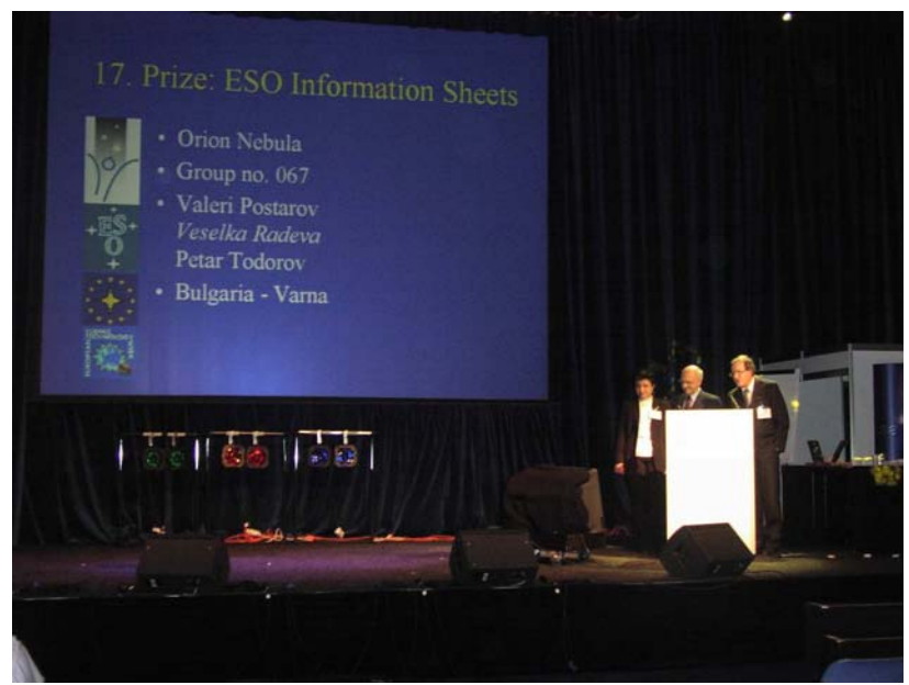
Giving prizes of Catch a Star during Physics on Stage 3

carefully evaluated all these reports, and 20 international winners were declared. The winning team was invited to visit the ESO La Silla Paranal Observatory (Chile).