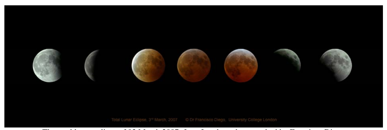
The total lunar eclipse of 03 March 2007, from London

Please note that this transfer does not affect my role as Newsletter editor. I will continue in this role until the IAU General Assembly in 2009, perhaps beyond.